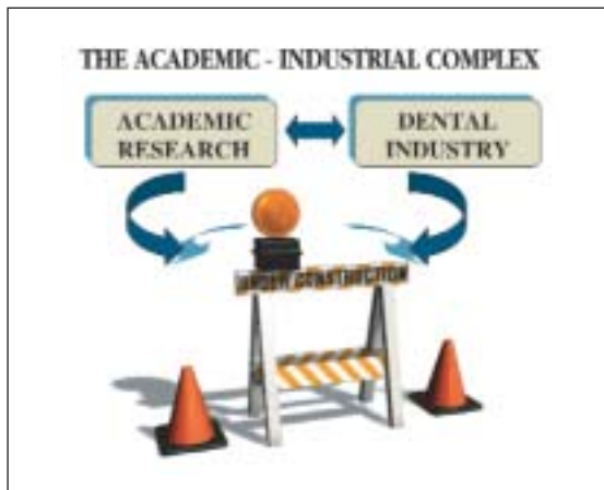
Figure 2 —Academia and industry already work together in the United States.

suit of knowledge for its own sake, it is not clear if US financial successes are solely a result of basic research. Some would argue that the capacity to bring these discoveries to the market is equally important if not more so. Clearly, each stage of the commercialization process requires investment and risk. The entire enterprise involves financial risk, and the level of risk at each stage of the process varies. For example, when success is measured by whether a discovery is commercialized, then risk is evaluated by the probability of attaining success. Of course, the probability of a discovery reaching commercial success is very low and therefore the financial risk involved high. For over a half-century, since the publication of the report by Bush, the policy of the US government has been that the American people should assume most if not all of this risk. Therefore, the federal government funds at least 95% of the basic research in the United States, and almost all of this research is conducted in academic settings and government laboratories.